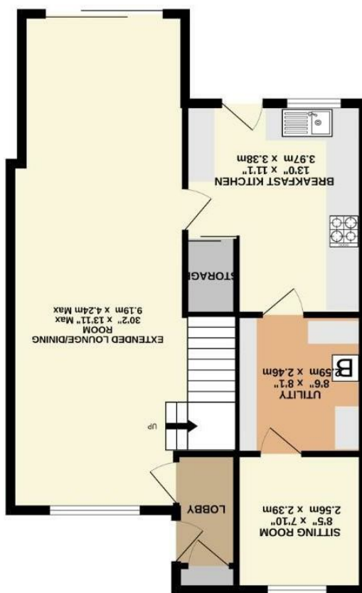
GROUND FLOOR 654 sq.ft. (60.7 sq.m.) approx.